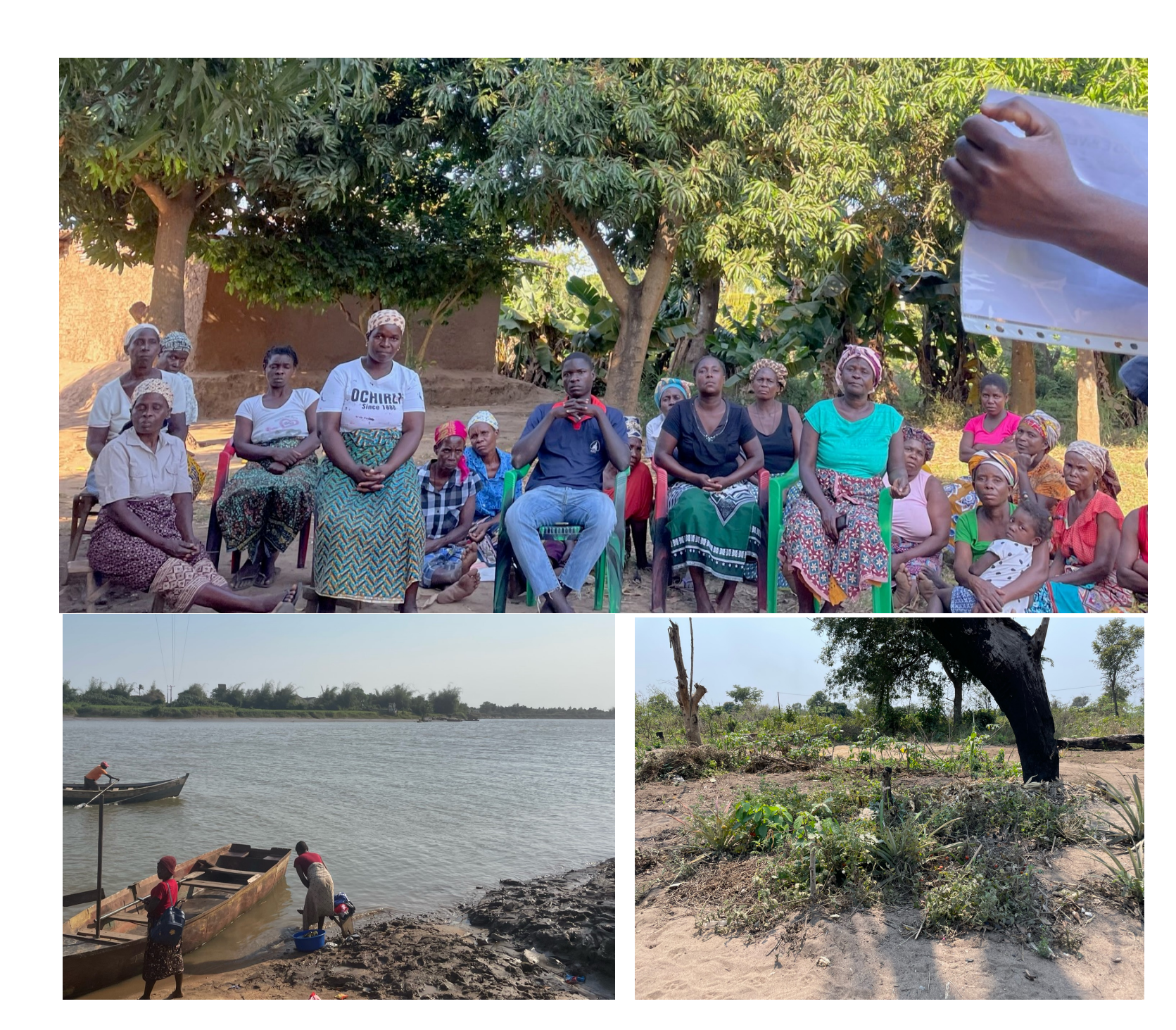
Figure 1: Focal groups in Búzi, River Búzi, and Subsistence farming.

Stakeholders: 109 local villagers (incl. farmers, fishers), and 7 government officials and experts (Fig. 1).