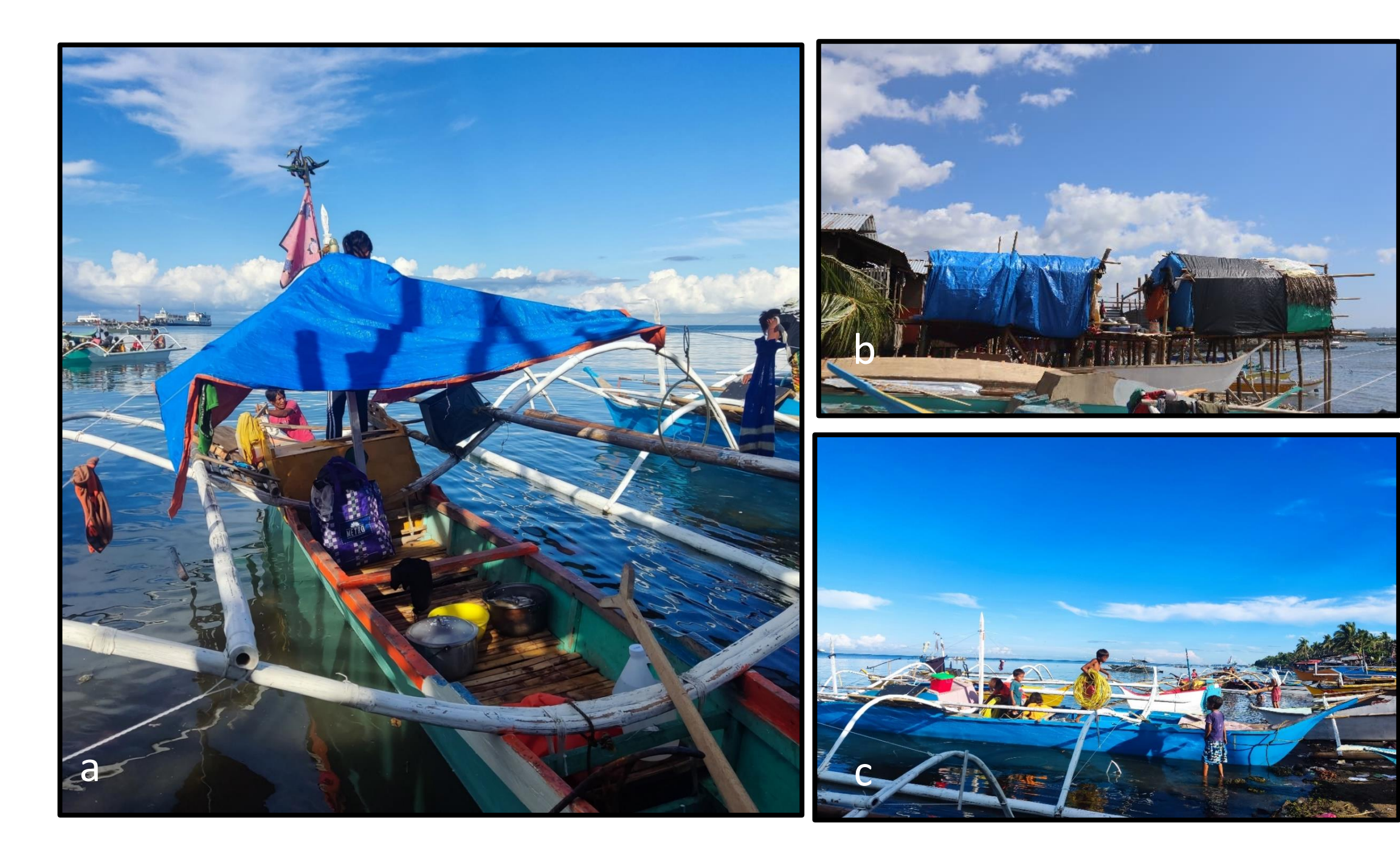
Figure a. Off to the neighboring island to attend a wedding celebration; Figure b. Shelter reconstruction of Sama stilt houses; Figure c. Children loading the fishing gears.