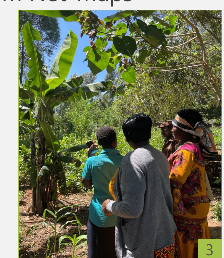
1. Semi-structured interview with key informant; 2. Net-Map session, 3. Introduction of PRA tools (own pictures)