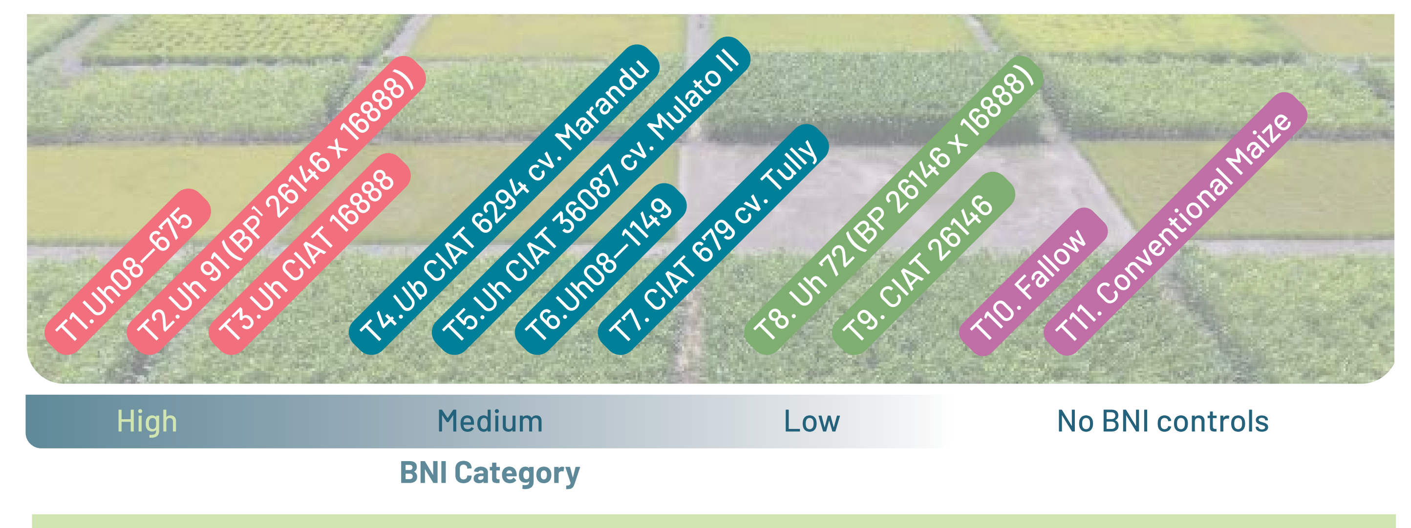
Figure 1. Experimental design. T=Treatment. Uh=Urochloa humidicola; Ub=Urochloa brizantha. T11.Conventional Maize (Maize planting history spanning over 10 years)

First Phase (2016), Final phase (2019–2023), experimental design in RCBD, 3 repetitions.