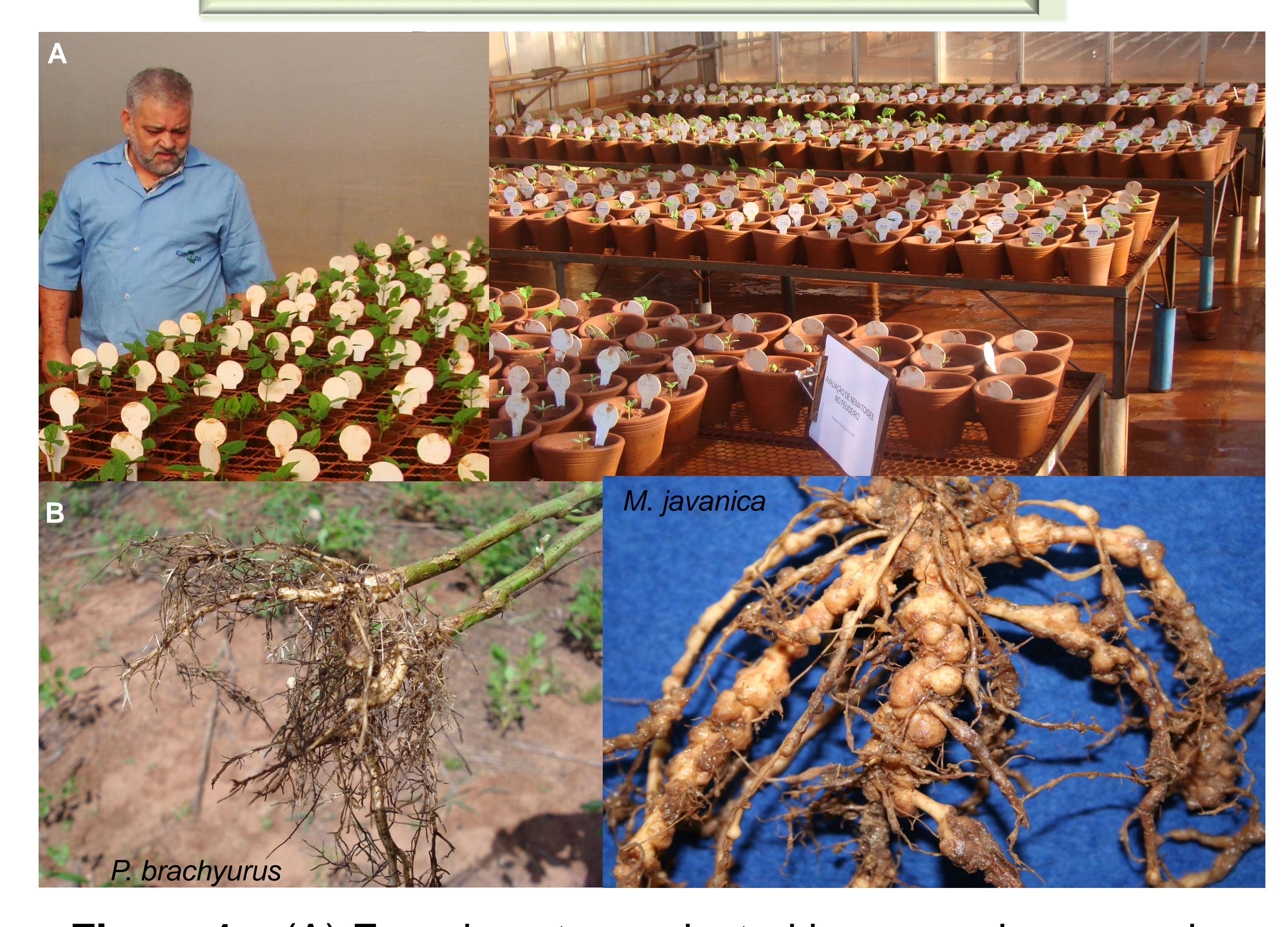
Figure 1 – (A) Experiments conducted in a greenhouse and (B) typical symptoms of nematodes in beans and soybeans.

The reproduction of each nematode spp. on common bean genotypes was evaluated in separate experiments, in a greenhouse environment at Embrapa's Experimental Station. The seedlings were inoculated by deposition of the suspension on the soil, close to the plant root, of 4,000 eggs ( H. glycines ), 500 juveniles and adults ( P. brachyurus ), or with 5,000 eggs ( M. incognita and M. javanica ). The incubation period varied according to the species, 28 days for Hg, 60 days for Pb , and 50 days for root-knot nematodes, Mi and Mj. The reaction was inferred from an index named relative reproduction factor (RRF), ratio between the reproduction factor (RF) of that nematode species on the genotype, and the corresponding RF on the susceptible standard. The RF is the ratio between the estimated mean of individuals recovered from the plant and the number of individuals inoculated.