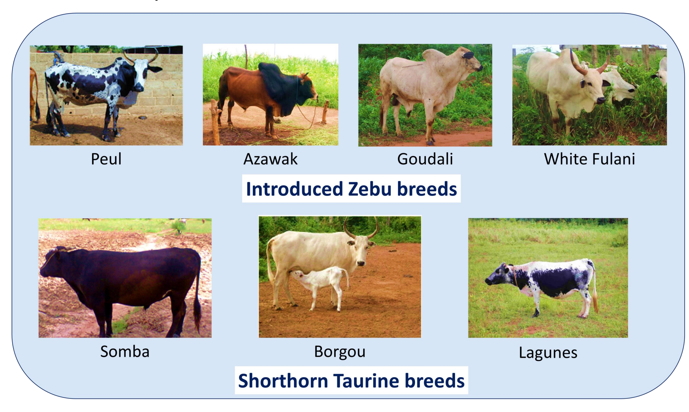
Fig. 1 Non-local and local cattle breeds raised in Benin.

Aim of the study: document the perception and adaptation strategies of non-local cattle breed herders under climate change (CC).