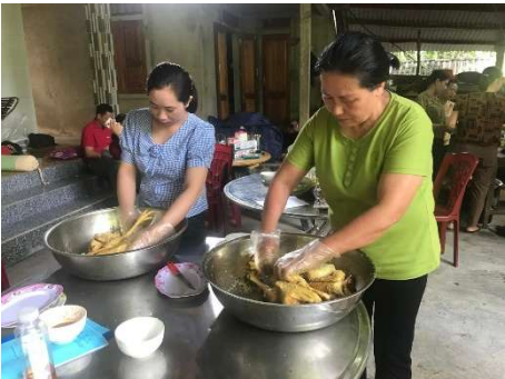
Training for processing