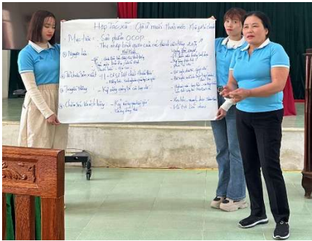
Training for financial management