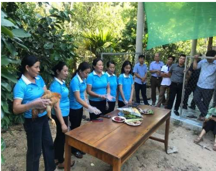
Training for online sales