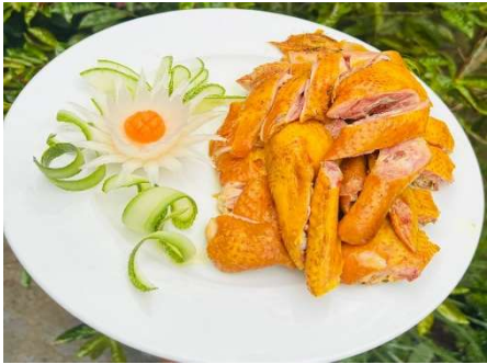
Salted herbal chicken