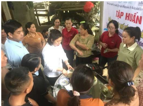
Training for farmers