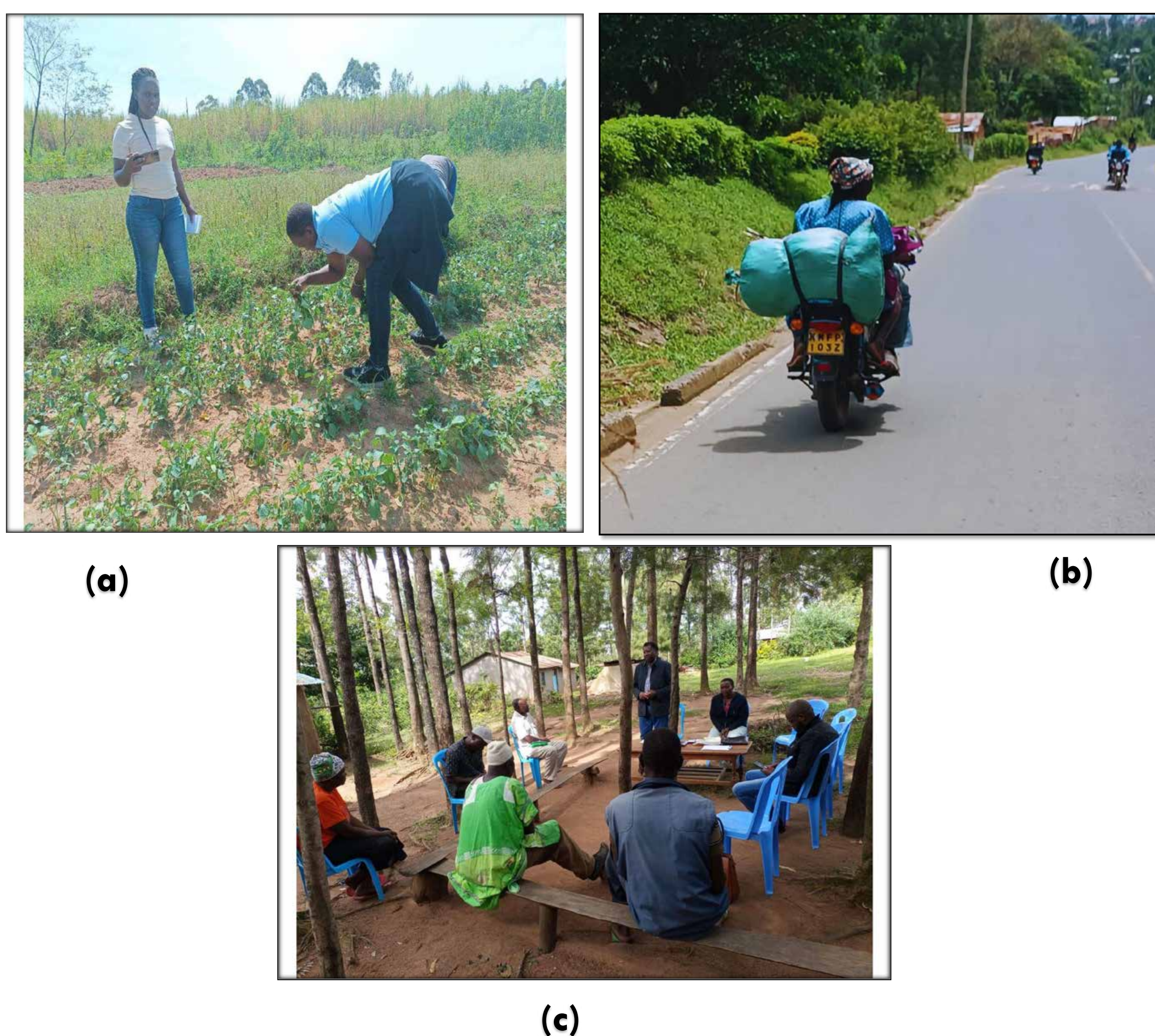
Figure 1: AIVs harvesting (a), transportation (b) and (c) AIVs stakeholders focus group discussion