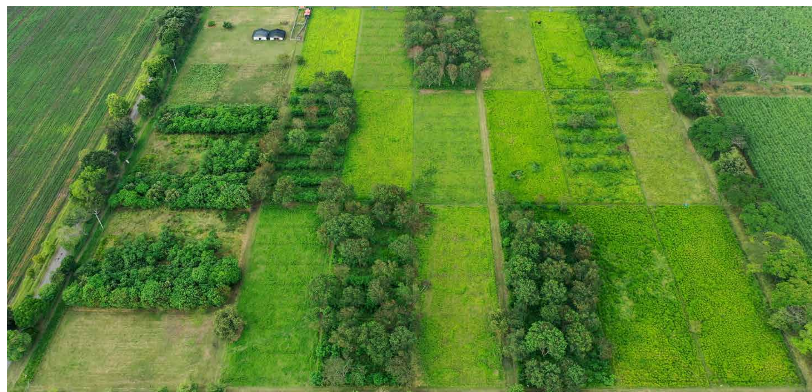
Figure 1. Silvopastoral trial at CIAT, Colombia.

Plant biomass production and nutrition quality of the pastures was higher in the grass-legume (T3 and T4) than the grass monoculture treatments (T1 and T2). N 2 O emissions were higher in the grass-legume pastures.