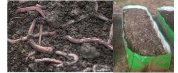
Fig. 6: Production of worms and vermicompost in vermiculture systems

Aquaculture -- also known as fish or shellfish farming -- refers to the breeding, rearing, and harvesting of plants and animals in all types of water environments including artificial tanks, ponds, rivers, lakes, and the ocean. Hydroponics is a method of growing plants using mineral nutrient solutions, in water, without soil. Combined production of fish and hydroponic plants in a recirculating aquaculture system.