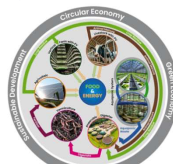
Fig. 8: Scheme of an innovative and phased integration of technologies that link renewable energy and agricultural production

Likewise, there are other technologies such as vertical agriculture that are already tested or in development to increase food production, which can use renewable energy to cover the lighting demand of plants without the need to import fossil energy from the electrical grid. However, all of the aforementioned technologies are being tested so far only individually or only with the levels of integration they require, thus missing out on the possible synergies that could also occur between them. However, for the authors of this contribution, the innovative and phased integration, partial or total, of these technologies can produce important synergies that contribute to a green and circular economy, promoting the use of bioenergy, addressing the water-energy-food-ecosystem nexus, and promoting local development in rural communities as shown in the following graph.