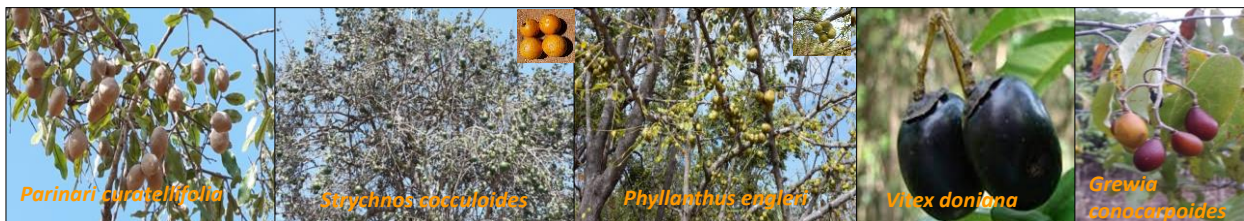
Fig 1. Five wild fruits species analysed for minerals and vitamin contents.

Tabora region is located at latitude 3° 00' – 7° 00' South and longitude 32° 00 – 34° 00' East. According to Njana et al. (2013), the region experiences a warm climate with annual average temperatures of 23°C and temperature ranges between 15°C and 30°C. Rain falls from November to May and the dry season begins from June to October. The main sources of income for the local inhabitants are crop farming, livestock rearing, beekeeping, and charcoal extraction and sales. Among the native ethnic groups include; the Sukuma, Waha, and Nyamwezi. Ethnobotanical information on the utilization of wild edible fruits was collected through conducting field surveys and interviews with the local people. Descriptive statistics was used to analyse ethnobotanical information while minerals and vitamin contents were tested for five fruits (Fig. 1).