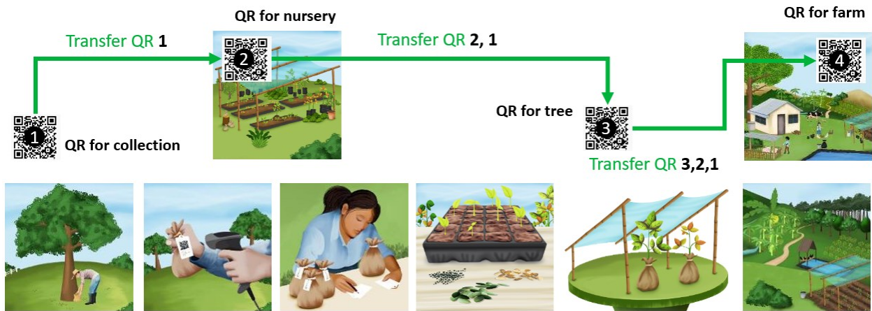
Figure 1. Workflow for tracking restoration from the seed collection to the planted tree.