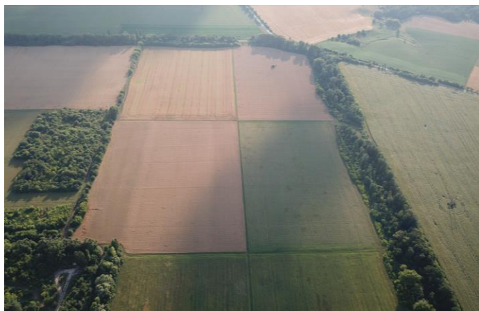
Figure 1. Study area in the organic landscape: demonstration site of Institute of Agroecology and Environmental Management of NAAS of Ukraine

Biotores of agricultural landscapes such as ecotones, forest shelter belts (FSB) and fields are marginal habitats of biota in the agricultural landscape. They are especially important in areas where the intensification of agricultural practices reduces the ecological quality of the landscape that leads to homogenization and expansion of alien species. The role of such biotores is to support biodiversity, help maintain the sustainability of surrounding agro-ecosystems and provide them with important ecosystem services. For better management of agricultural landscapes and preservation of biota habitats, studies of population dynamics and assessment of negative impact factors are necessary.