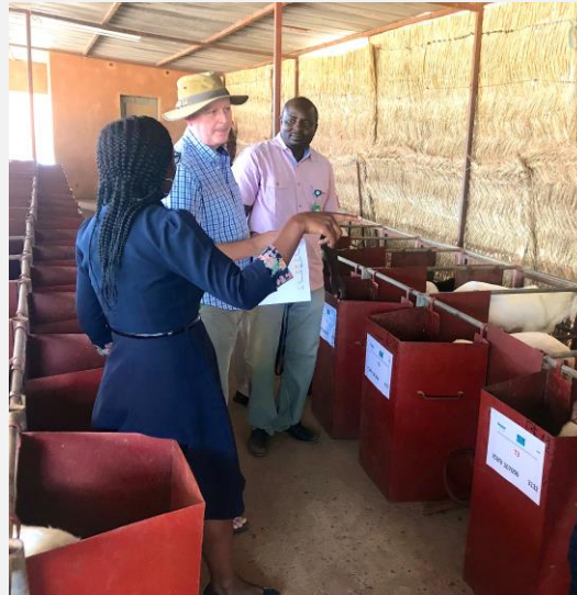
Picture 2. Feeding experiment of sheep fed with stover of different millet varieties