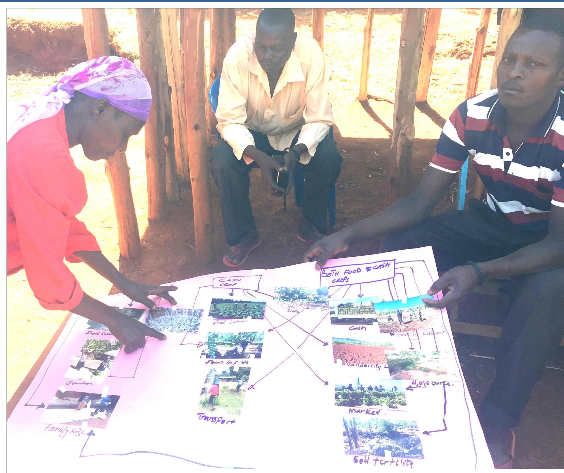
Fig:1 Participants creating the collage

Photographs portrayed drivers of decision making