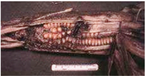
Fig. 1: An example of Aspergillus infested ear of corn

Aflatoxin, a class of mycotoxin produced by 2 fungal species Aspergillus flavus and Aspergillus parasiticus is a secondary metabolite of these fungi species. Aflatoxin is known to interact with the basic metabolic pathways of the cell disrupting key enzyme processes including carbohydrate and lipid metabolism and protein synthesis (Cheeke and Shull, 1985). By virtue of the multiplicity of actions of aflatoxin on the liver and other cells containing mixed function oxidase systems, the effects of this toxin on animals are profound and far reaching.