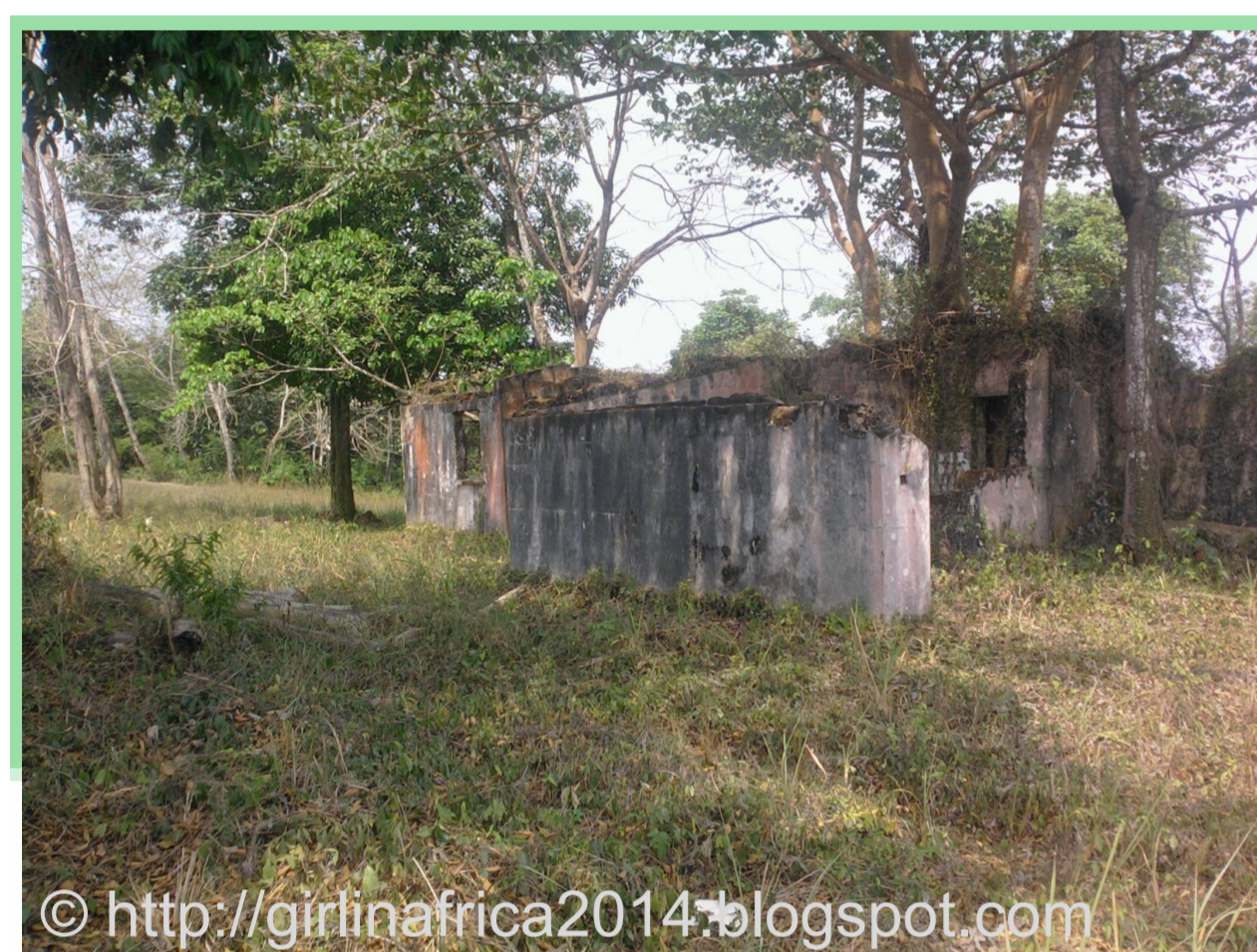
Ruins at Njala campus are still present