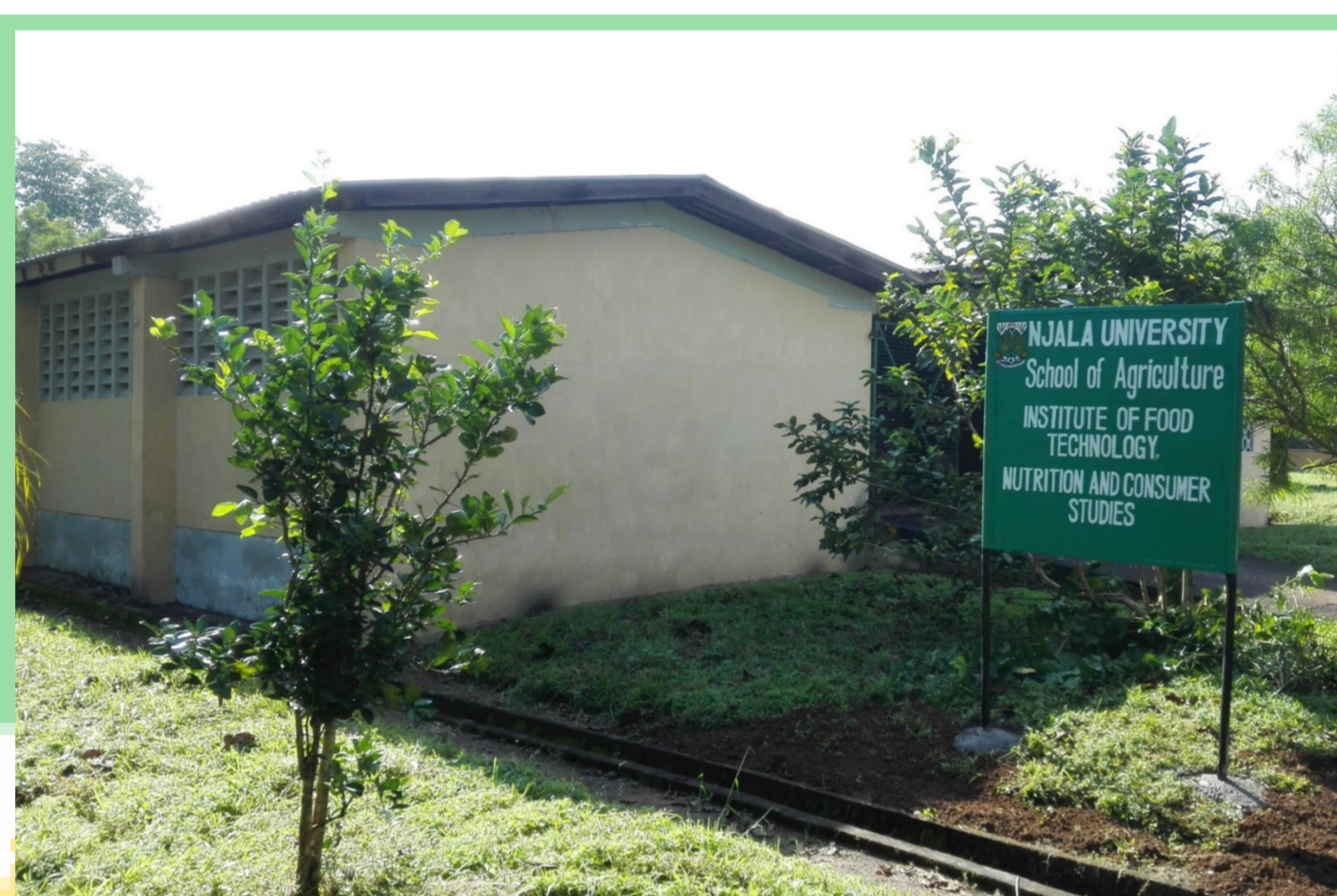
Institute of Food Technology, Nutrition and consumer studies