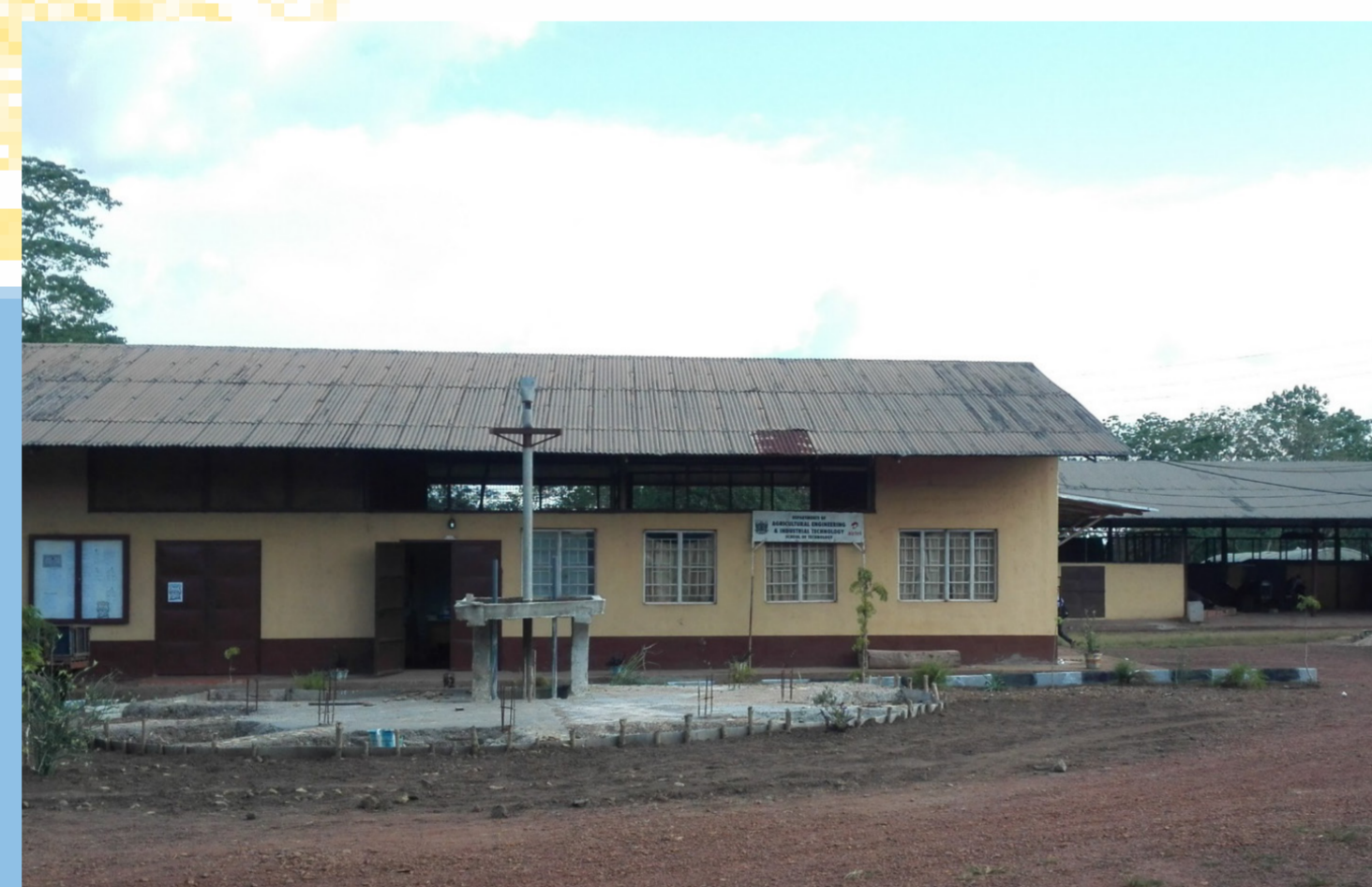
Dpt. Agricultural Engineering and Industrial Technology