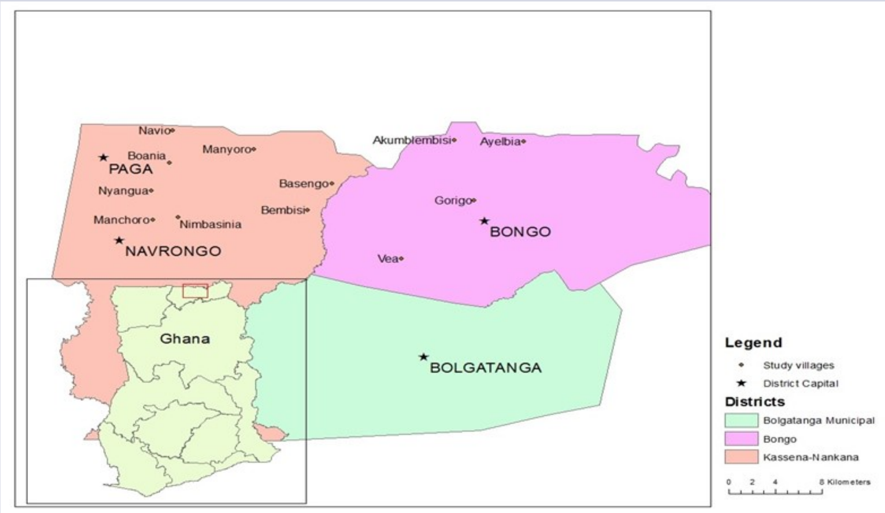
Figure 1: UER of Ghana with Communities.

The Upper East region (UER) is mostly populated by subsistence agriculture farmers living under the local poverty line. They face hard climatic conditions and have deteriorated their land. A reforestation PES program in the region could contribute to alleviate the situation.