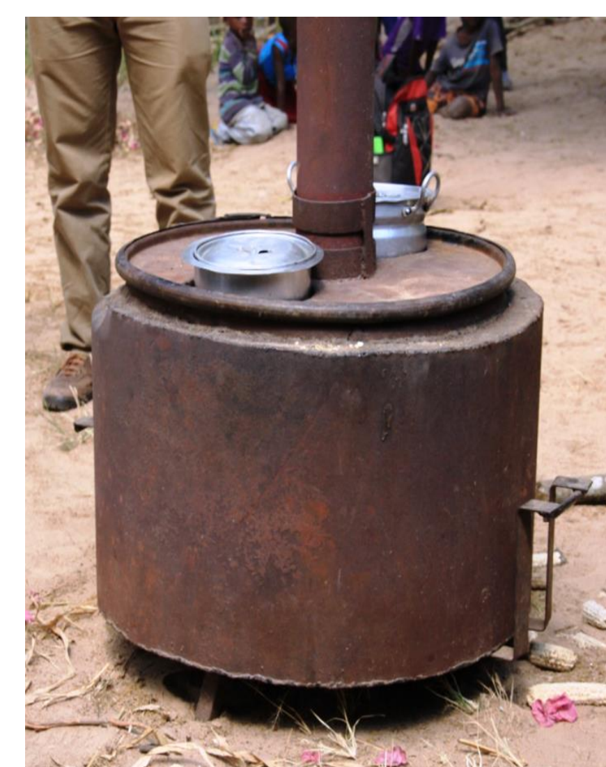
TLUD reactors at SUA TLUD reactor in Ilakala