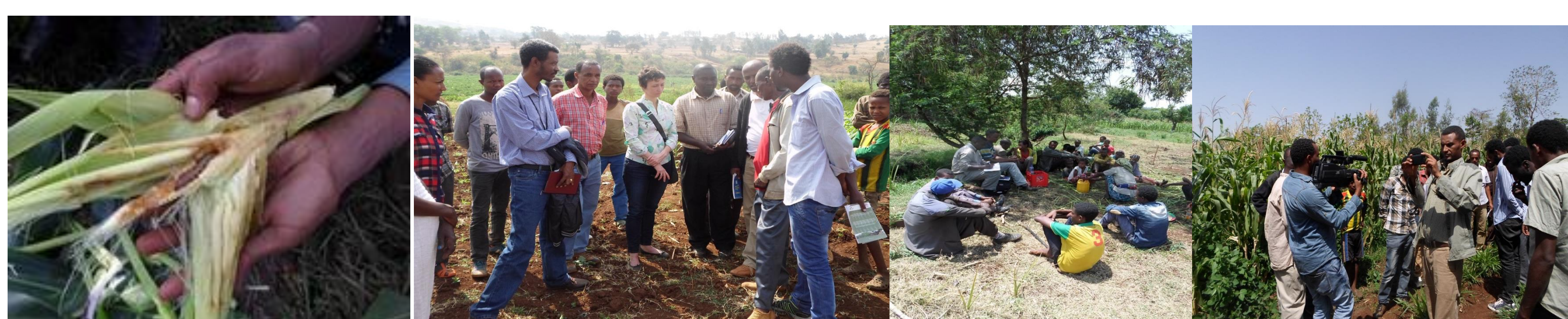
Fig 3. Stakeholder interactions and learning to address stemborer problem