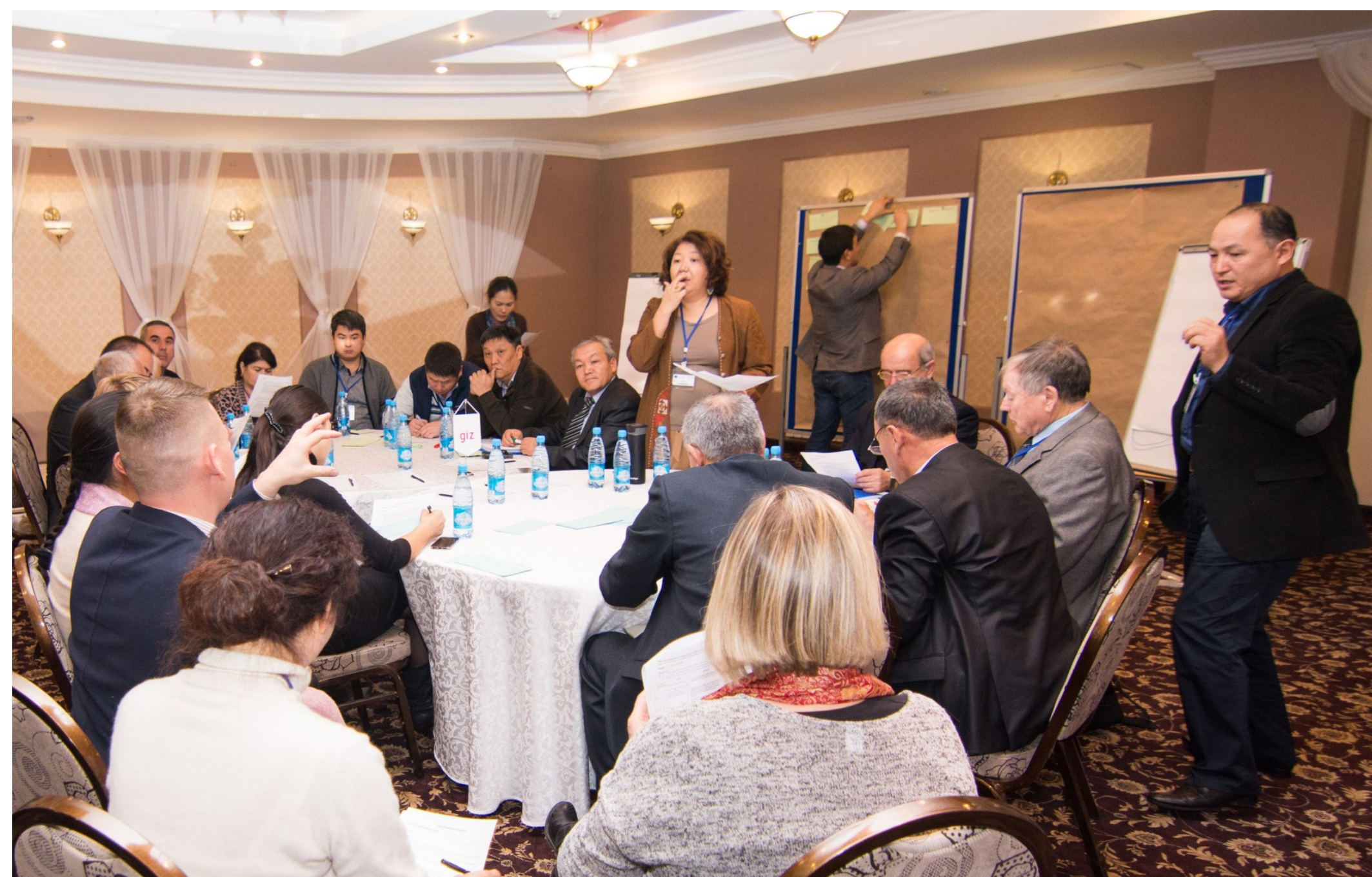
Picture 1. The International Practitioners Conference on Pasture Management. Bishkek, 2014

In the last two decades, the governance of pasturelands in Central and Inner Asia has transitioned from state-led pasture management to a variety of new tenure arrangements ranging from private to common property systems. There is significant potential to improve pasture management using the vast body of experience and knowledge accumulated since the 1990s, but opportunities for experience sharing have so far been insufficient to fully realise this potential.