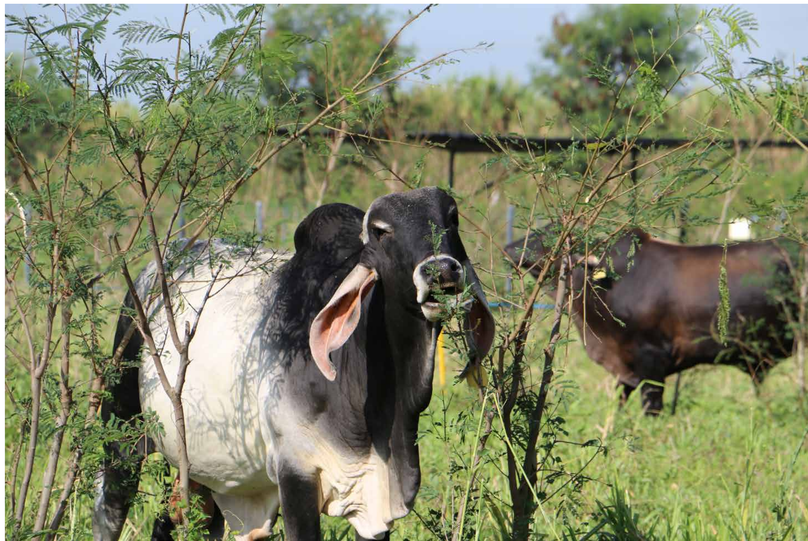
Picture 1. Cattle grazing Brachiaria Hybrid, CIAT BR02/1752 cv. Cayman and Leucaena diversifolia