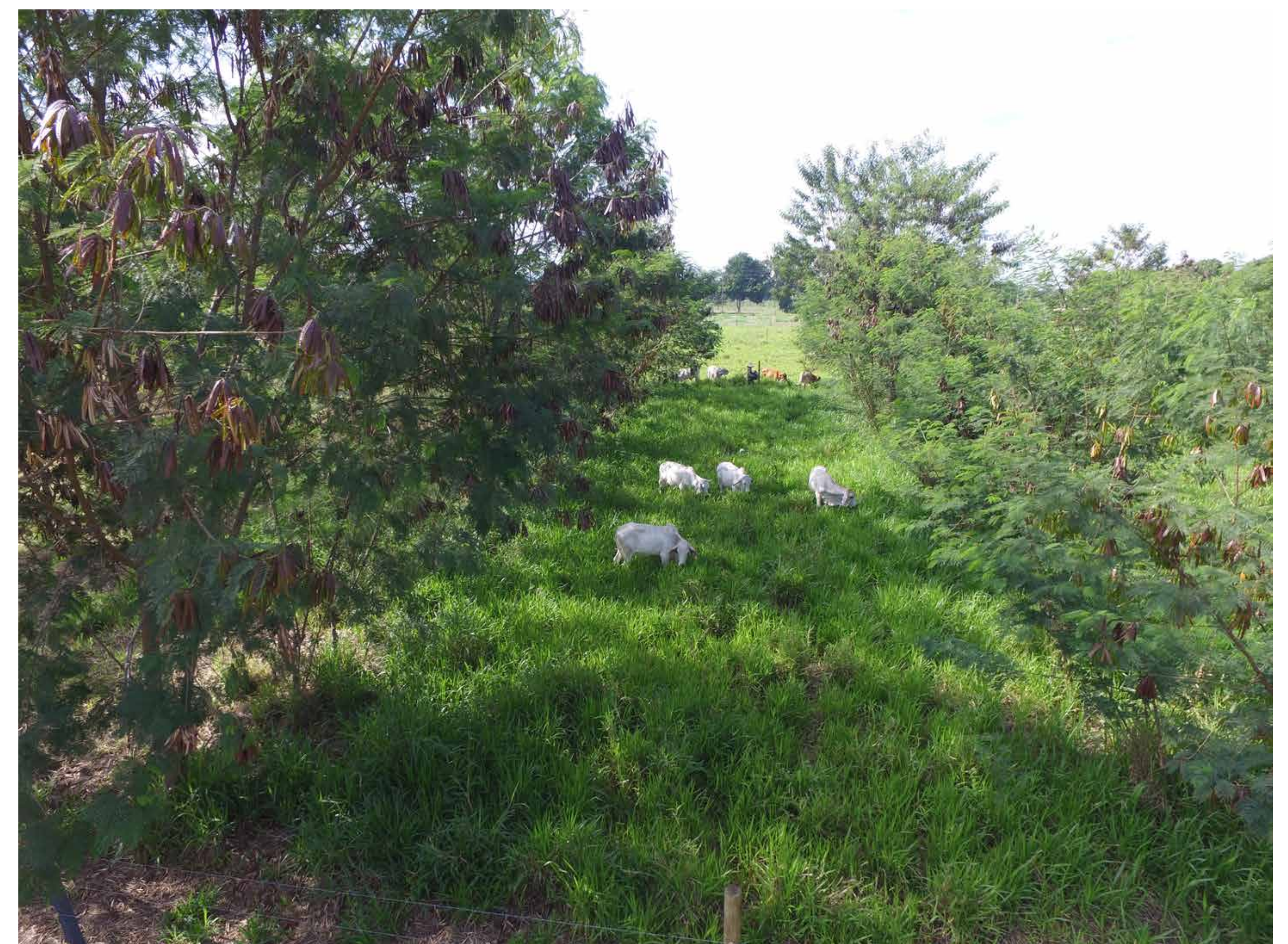
Picture 2. Cattle grazing on a silvopastoral system