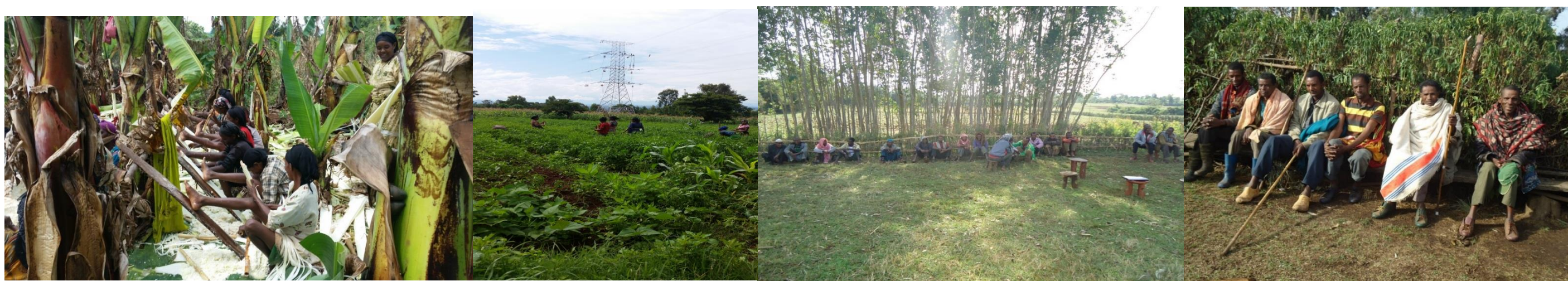
Figure 1. Collective labour groups, public meeting and social event as means of learning.