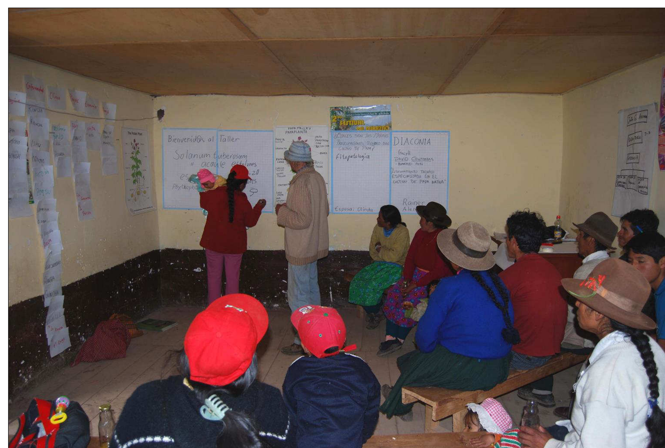
In theoretical classes ... (Nueva Granada)