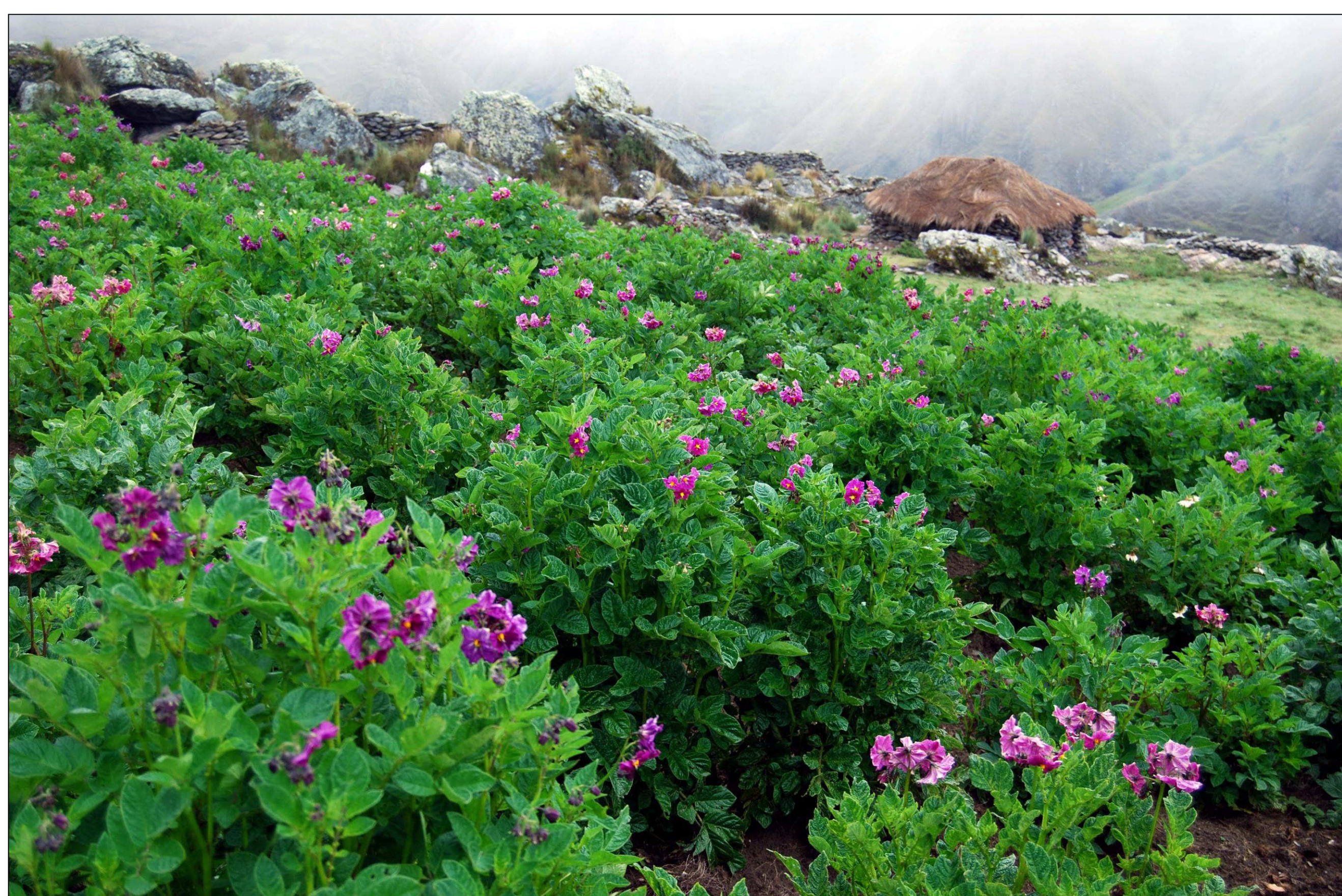
Native potato (Carhuapata)

Conclusion from the workshops - among others: Agriculture requires training throughout lifetime.