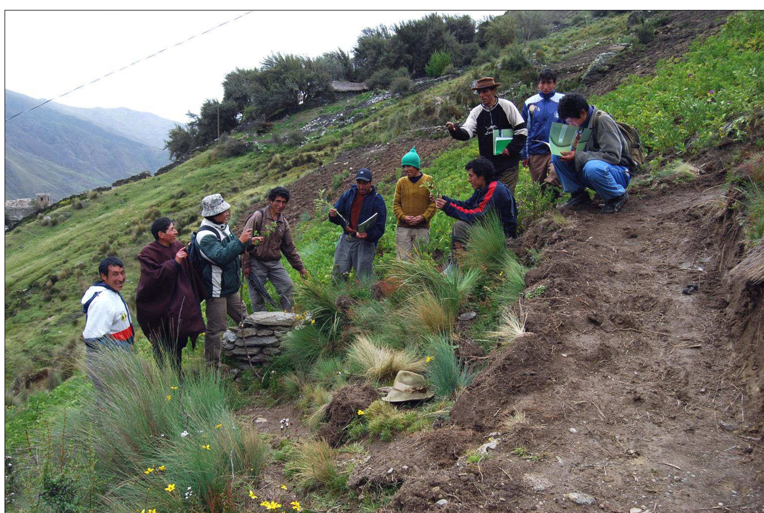
... and in field practices we clarify the problems (Sogobamba)