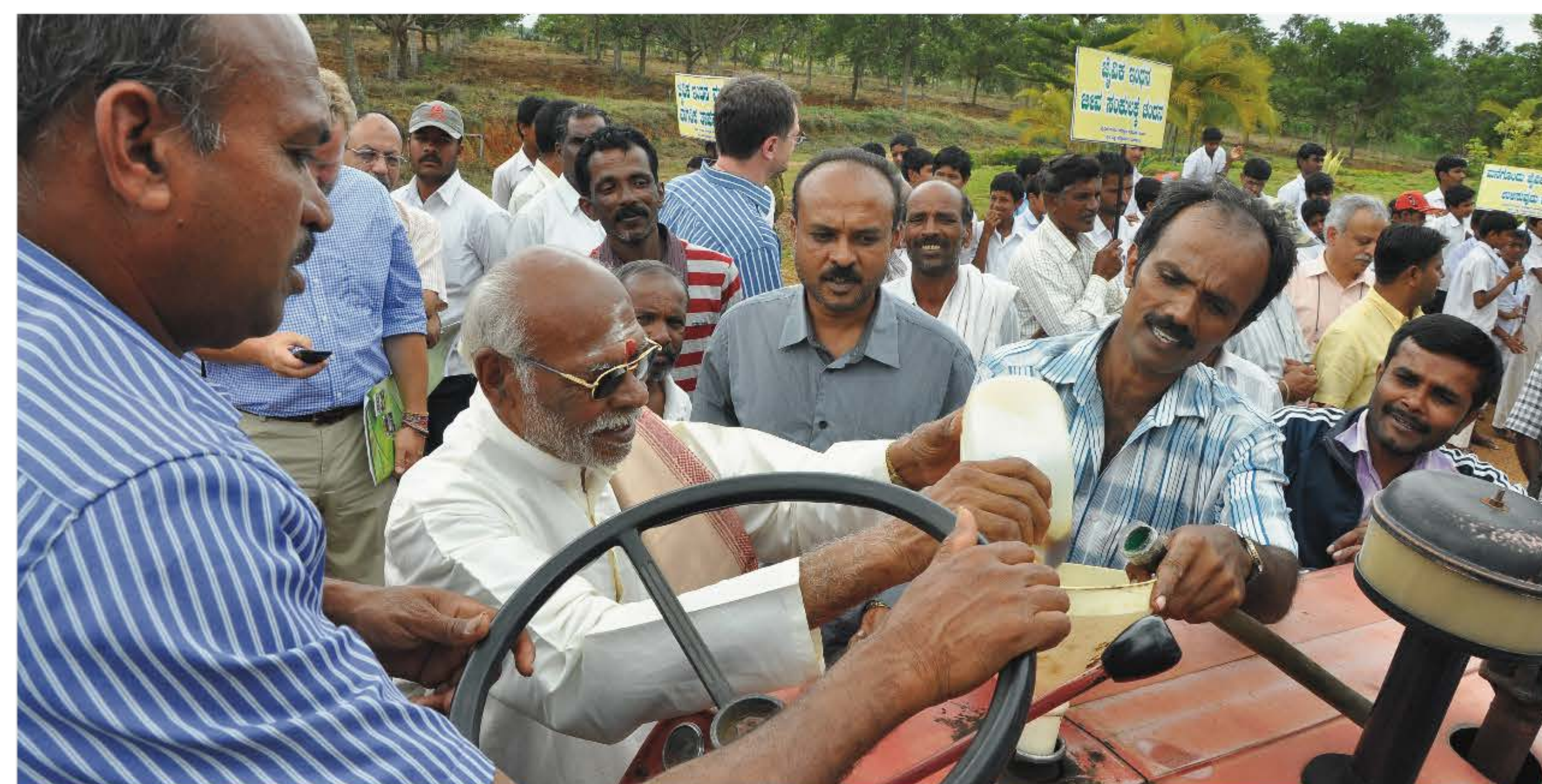
Demonstration of tractor refueling with SVO produced in Hassan District, Karnataka State, India.