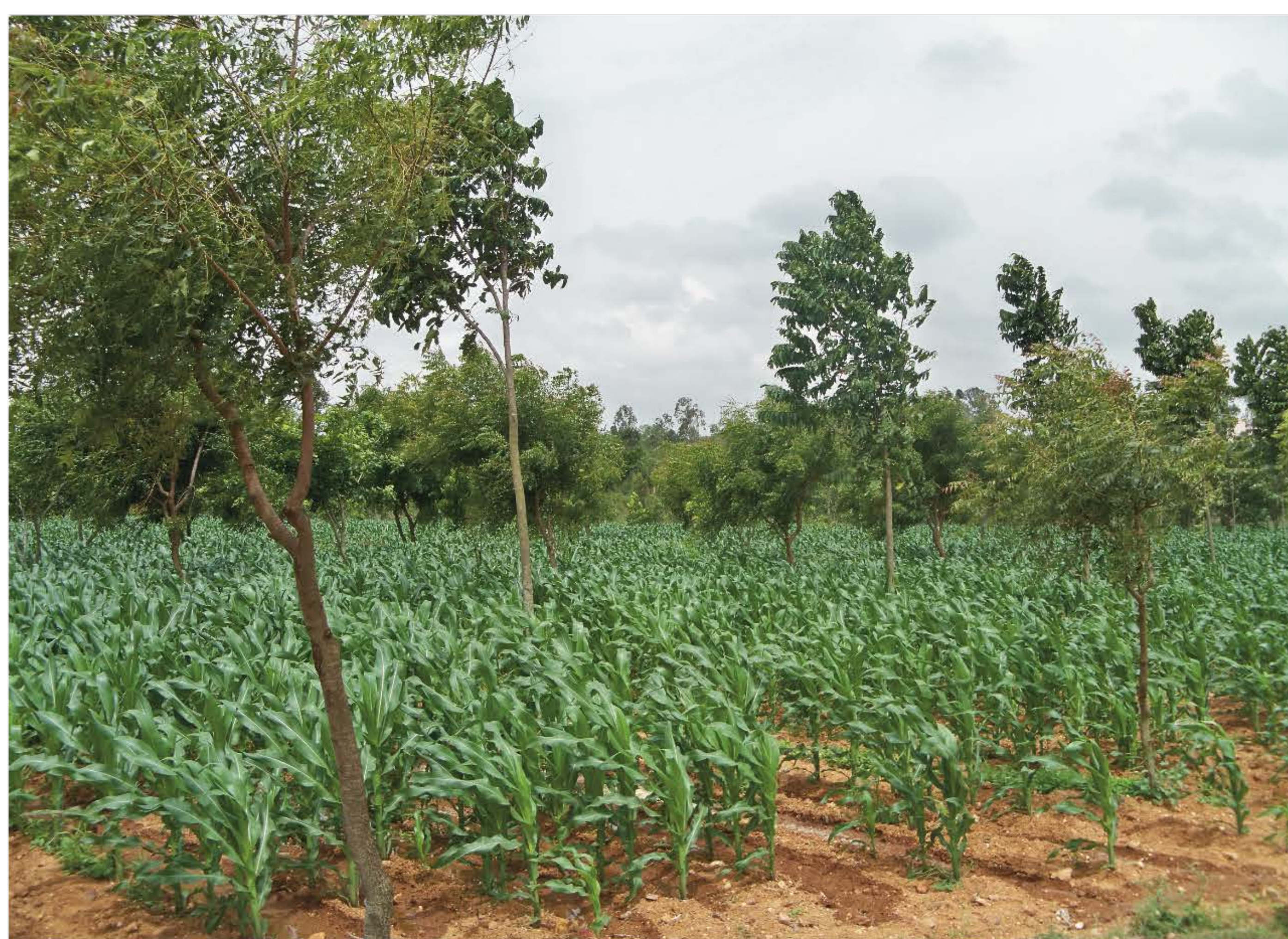
Example of an agroforestry model supported by the Programme in India – perennial oilseed species are incorporated into traditional annual crop systems for an integrated food-energy production.