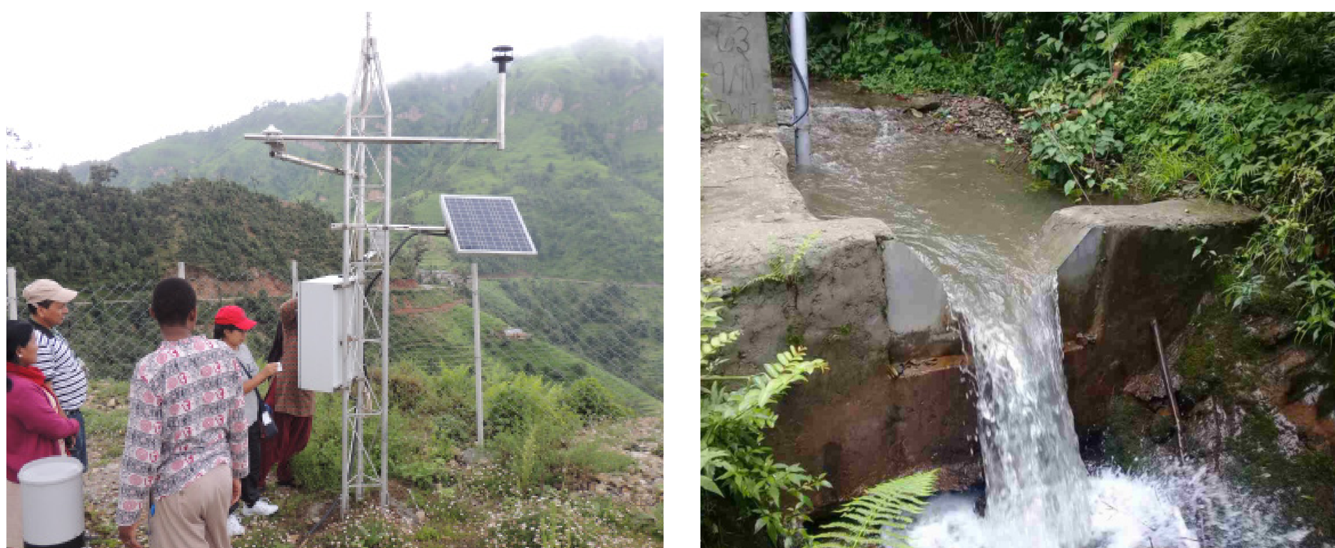
Climate (left) and hydrological (right) monitoring stations have been setup at the study sites to gather hydro-meteorological data. Shown are stations in Shikharpur.

Springs are a major source of water in the hills and mountains of Nepal. Since 2014, with funding from the Asian Development Bank and the Nordic Development Fund, the "Building Climate Resilience of Watersheds in Mountain Eco-Regions" (BCRWME) project is working to provide 45,000 households in vulnerable mountain communities with access to more reliable water resources via spring or surface water sources. Despite the recognition of springs as a livelihood driver in these communities and the observed alarming trends in the drying up of springs, a scientific understanding of mountain springs in Nepal has not been established. Under BCRWME, the International Water Management Institute (IWMI) is leading comprehensive research into characterizing mountain springs and identifying science-based interventions that can increase reliability and water availability in these sources. IWMI is conducting isotope analysis to investigate hydrological processes in mountain springs and identifying recharge zones in order to sustain springs in Banlek and Shikharpur in western Nepal.