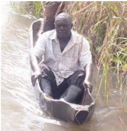
Extension officer reaching isolated village