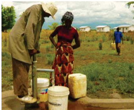
New borehole for clean water