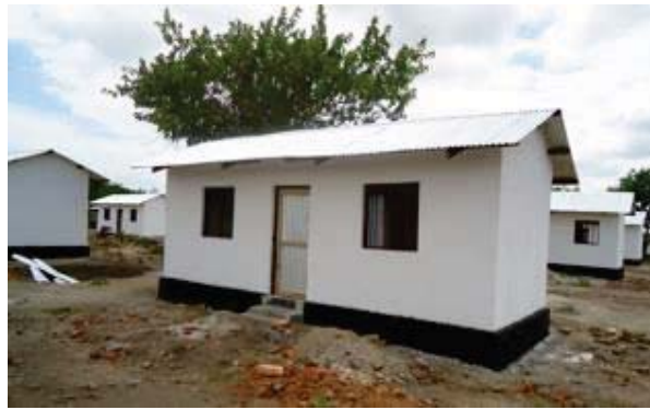
New waterproof house