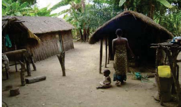
Typical thatched house on Farm 411