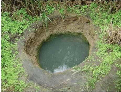
Before: Shallow, dirty well