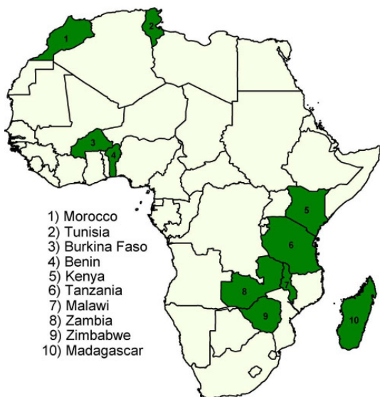
Figure 1. Countries with case studies within CA2Africa project

These experiences are shared during a series of workshops in the five project regions in West, North, East and Southern Africa and Madagascar. CA is analysed and understood using a conceptual framework that distinguishes three scales of analysis: field, farm and regional scales (see figure 2).