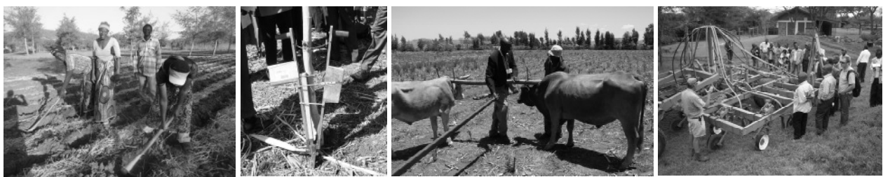
Fig. 3. Examples of different mechanization levels in CA: basins, jab planter, animal drawn direct seeder, fully mechanized pneumatic drill

The increased amount of labour required for weeding with CA may outweigh the labour-saving gained by not ploughing the soil unless herbicides are used to control weeds. The reallocation of labour, especially to weeding, often is implying more work for women. Weeding is labour intensive and farmers may find the use of herbicides attractive, but often lack the cash to invest in them. In many regions, development of better markets is needed before farmers can invest in herbicides, seeds, fertilizer and no-till equipment (see figure 3). In general, there is in many parts of Africa a need for (market) support for smallholders in order to create economic incentives to invest in agriculture.