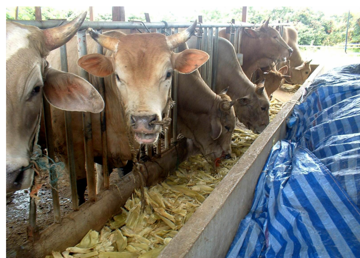
Charolais × Thai native bulls