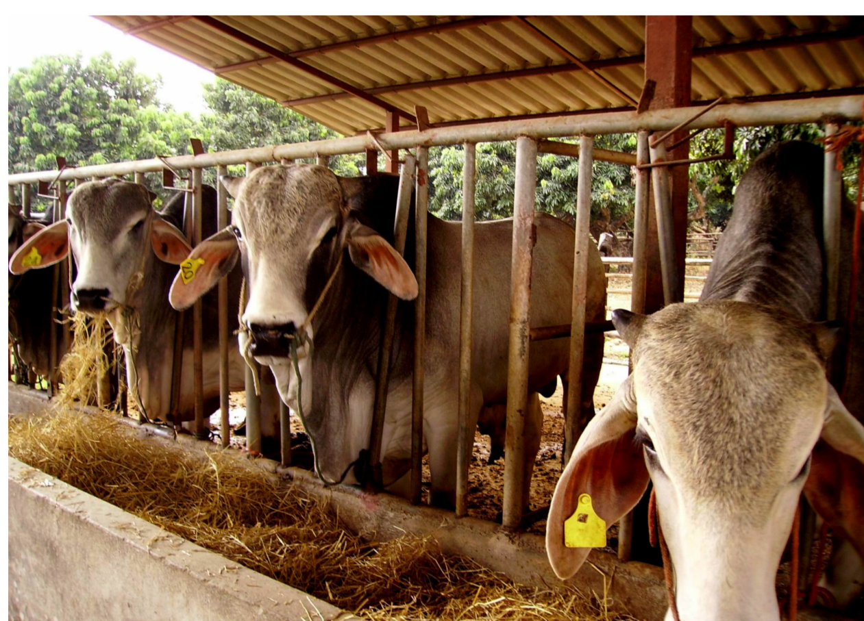
Brahman × Thai native bulls

The objective of the present study was (1) to assess fatness parameters and i.m. fatty acid composition of longissimus dorsi ( ld ) muscle of Brahman (BRA) and Charolais × Thai native (CHA) bulls and (2) to identify the optimum genotype and slaughter weight of cattle for the fattening system in Northern Thailand.