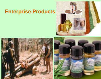
Figure 1: Enterprise products