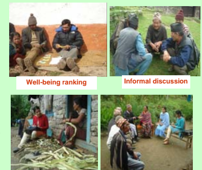
Figure 4: Methods used of data collection