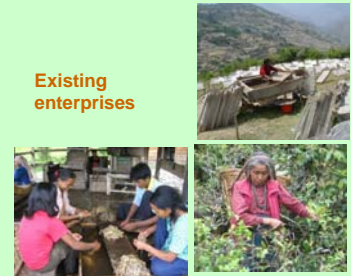
Figure 2: Existing enterprise activities