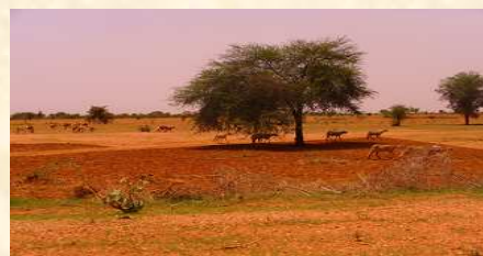
Figure 4. Overgrazing by sheep