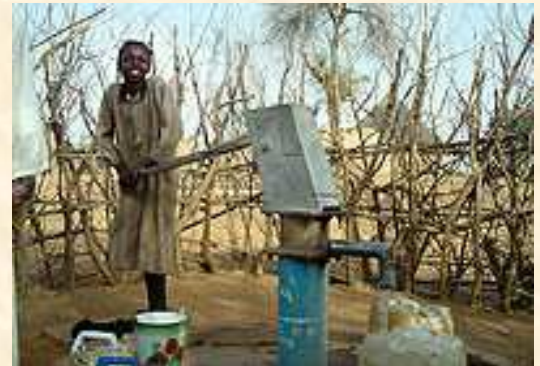
Figure 1. Children try a new hand pump installed by UNICEF