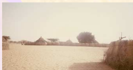
Figure 3. Sand dunes surrounded villages