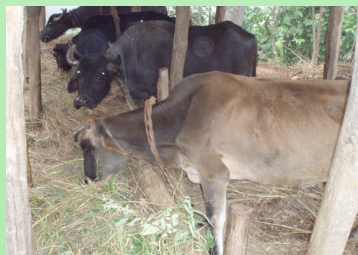
A typical livestock farm on site

Dadeldhura district of the Far-western Development Region of Nepal was purposively selected for this study. Altogether 80 households, 40 each from scheduled and non-scheduled castes, were directly surveyed by using semi-structured questionnaires. In addition to the questionnaire based survey, Participatory Rural Appraisal (PRA), focus group discussion, and consultation with the key informants were also carried out. Data were analyzed by using SPSS 15.0.