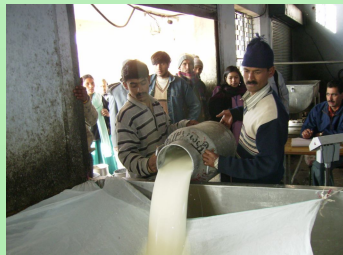
Pouring milk into a collecting tank