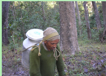
Carrying milk to cooperative