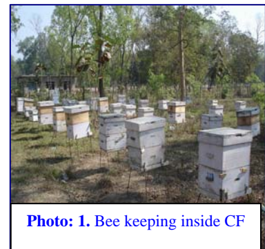
Photo: 1. Bee keeping inside CF

As Nepal is an agrarian country and more than 80% of the population lives in the rural areas ( CBS, 2004 ), the participatory forest management provides the ground for its economic and institutional development. There are very less financial supports and fiscal budget allocated by the government. With the limited supports and budget, the rural areas can hardly fulfill its desires of development and poverty reduction. For this reason, they should rely more on the resources what they have. In these contexts, the natural resource, like forest can be potential resources to turn on their development fate.