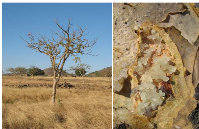
Figure 1. B. papyrifera tree in the Nuba Mountains (left) and exudated frankincense at a tapped stem (right).

A three factor randomized complete block experiment with three replications was set up in the Umabdalla natural forest reserve (11°40'N, 30°30'E) from October 2001 till May 2002. The first factor was tree stem diameter at 1.3 m height (dbh) at three different diameters (10–15 cm, 16–20 cm and >20 cm), the second factor was tapping date at three different times (October 7, October 15 and October 21) and the third factor was intensity of tapping at two levels (2 and 4 positions on the tree stem). Each treatment combination was assigned to three trees, making a total of 162 trees. Tree stems were tapped with the traditional tapping tool mengaf. The resin of each tree was collected, dried in the shade for ten days and weighed.