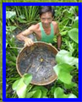
Fish from a Pond