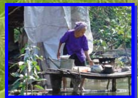
Kitchen at the canal