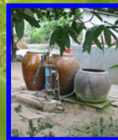
Hand pump and storage pots