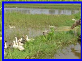
Duck flock in a rice field