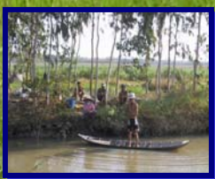
Water source: Canal