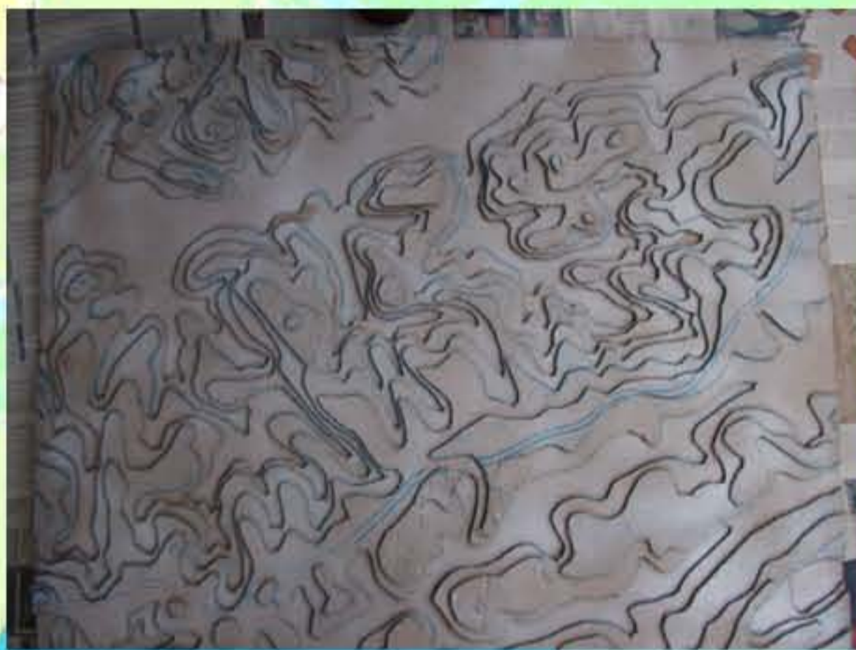
Blank model made of cardboard layers

The mapping process below shows the main steps from the blank model to the finished one.