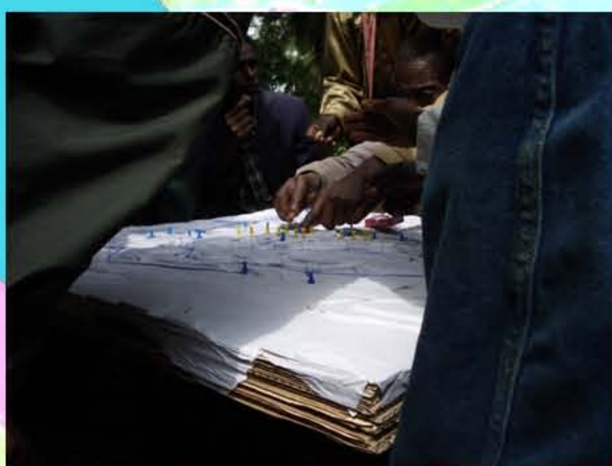
The mapping process