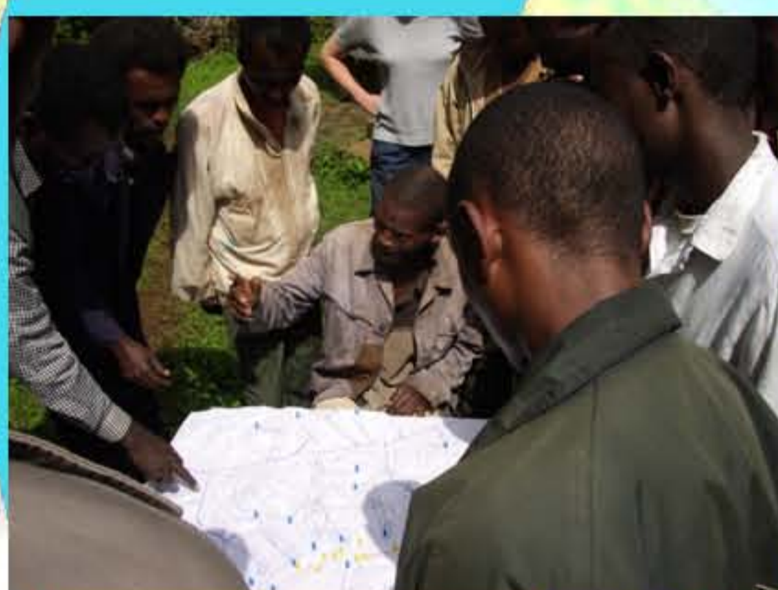
Discussing the model and legend