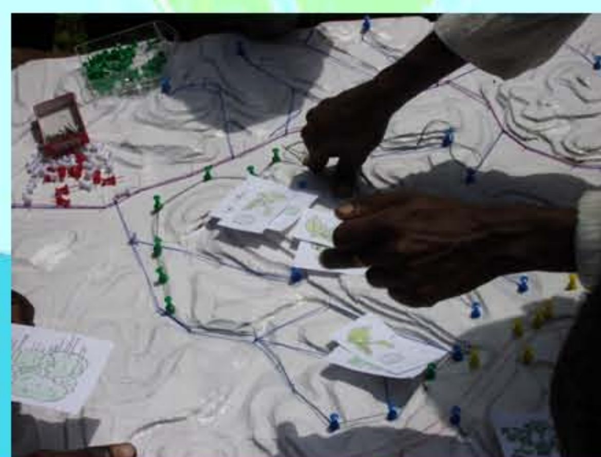
Using the icons in the mapping process