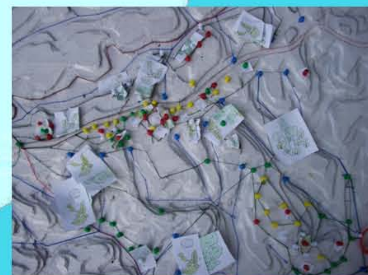
The blank model after mapping