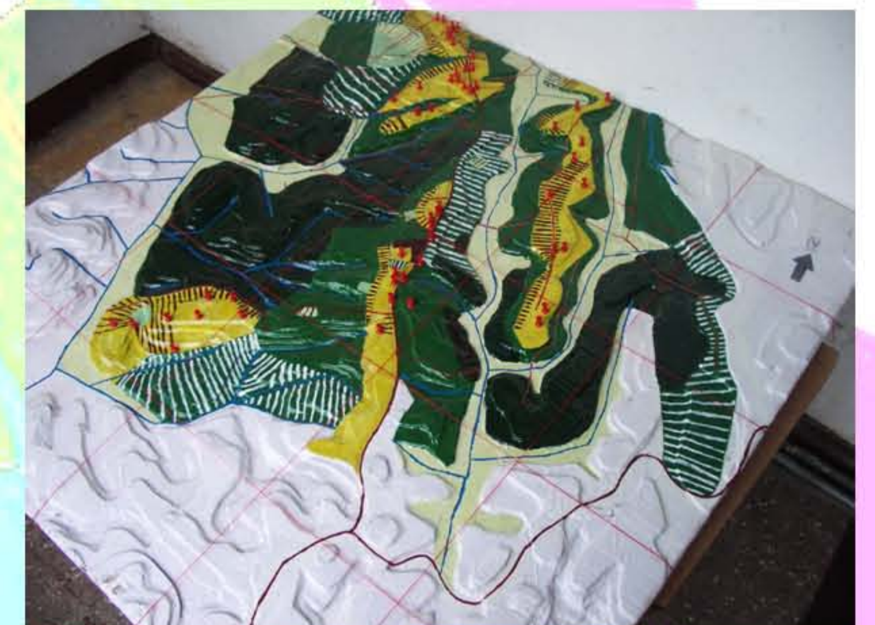
The coloured model with grid and north arrow