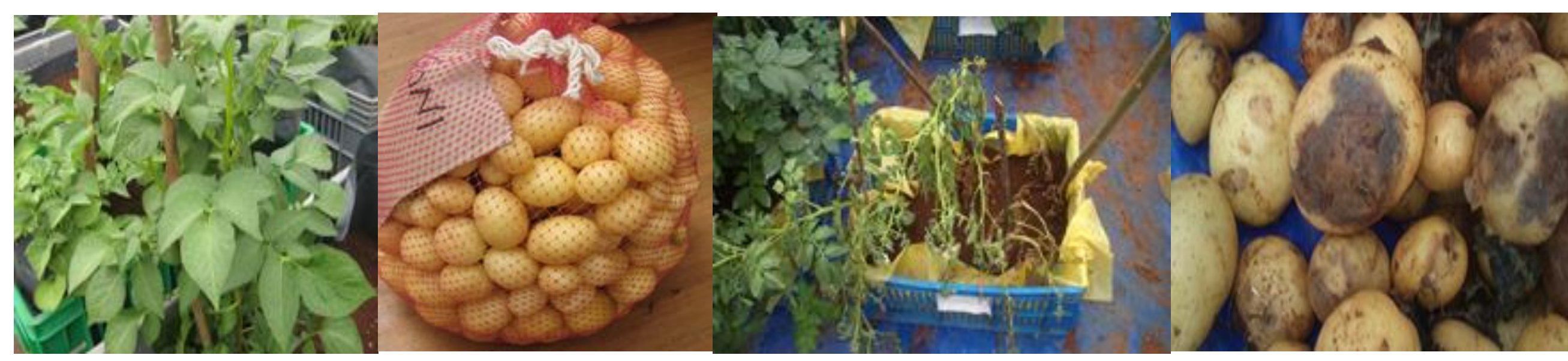
Figure 1. (A) Healthy potato plant (B) healthy tubers (C) BW Infected potato (D) BW infected tubers

Alternative low-cost and sustainable technical solution to manage the disease is therefore apparent. Integration of biological control agents (BCAs) using beneficial microorganisms in potato farming system is hence a promising approach to sustainable production especially in Kenyan context. The strategy involves isolation of indigenous Rhizobacteria (BCAs) and screening under invitro and invivo to identify promising isolates and testing in field trials to determine their efficiency and effectiveness. The poster describes method and results of the trials that were done in Kenya.