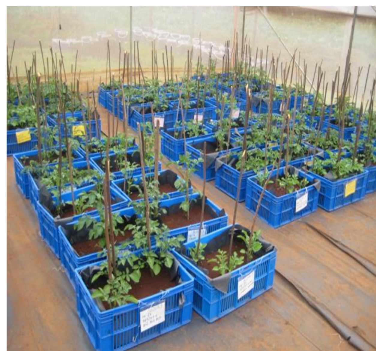
Figure 2. Arrangement of the treatments in the greenhouse