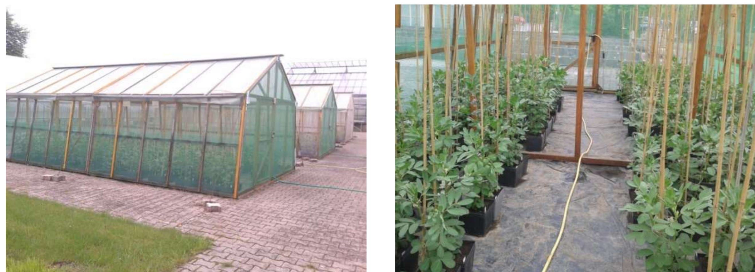
Fig.1 The experiments in bee isolation houses

189 lines of winter faba bean population, developed in Göttingen since 1989 from 11 founder lines (inbred winter faba bean lines). The 11 founder lines were mixed to produce a recombining population. After nine generations, around 400 lines were obtained and named Göttingen winter bean population (GWBP). The 189 lines were randomly selected from GWBP and bred via single seed descent.